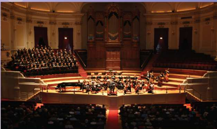
Concertgebouw - Amsterdam