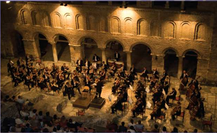
Ohrid - Macedonia