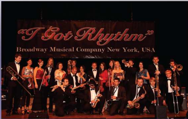
George Gershwin "I Got Rhythm"