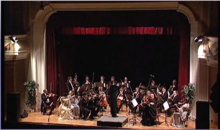
Operetta Galakonzert, Prague