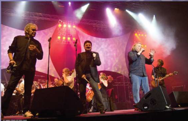
Rock meets Classic 2010