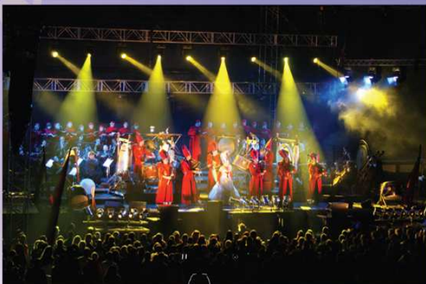
Cantus Buranus II.